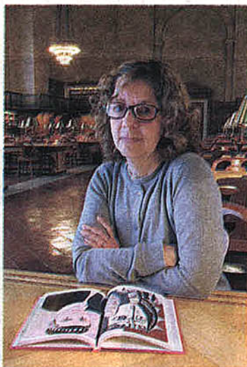
Maira Kalman has illustrated "The Elements of Style."

"The Elements of Style" is being performed tonight at 8 at the New York Public Library, Fifth Avenue and 42nd Street; (212) 868-4444.